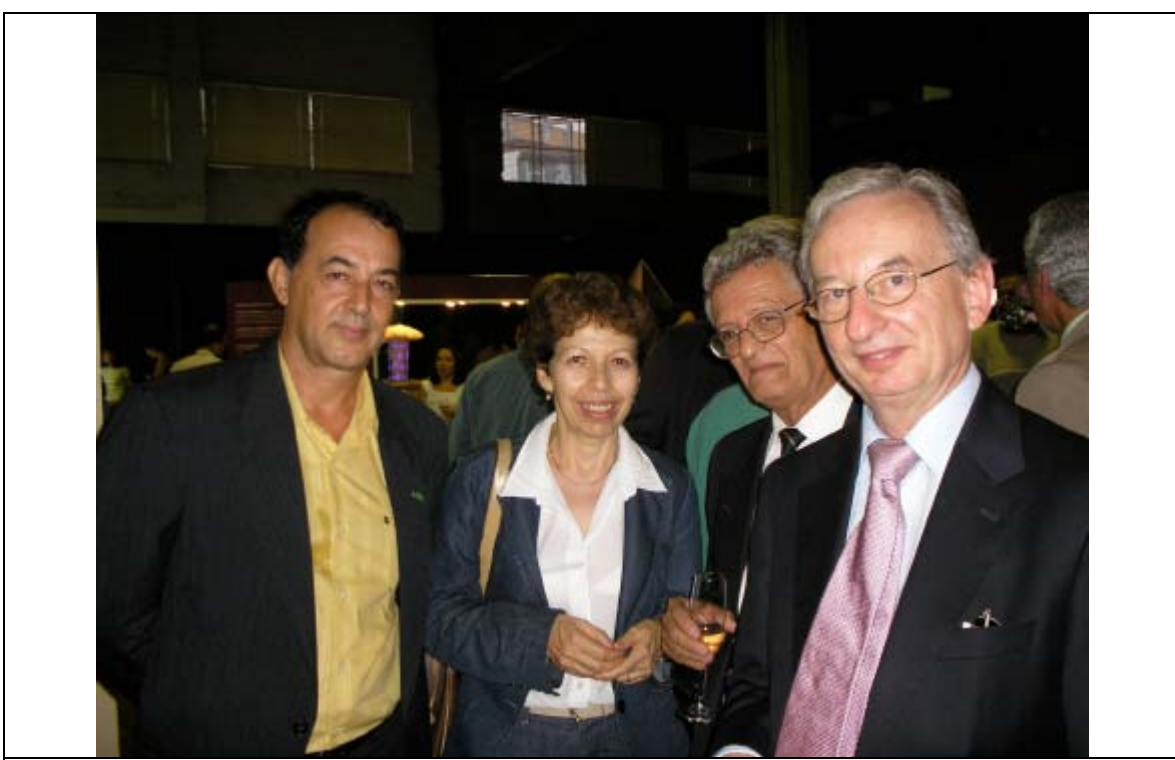
IYPE Brazilian Launch Event Cerimony - Estação Ciência - January 2007