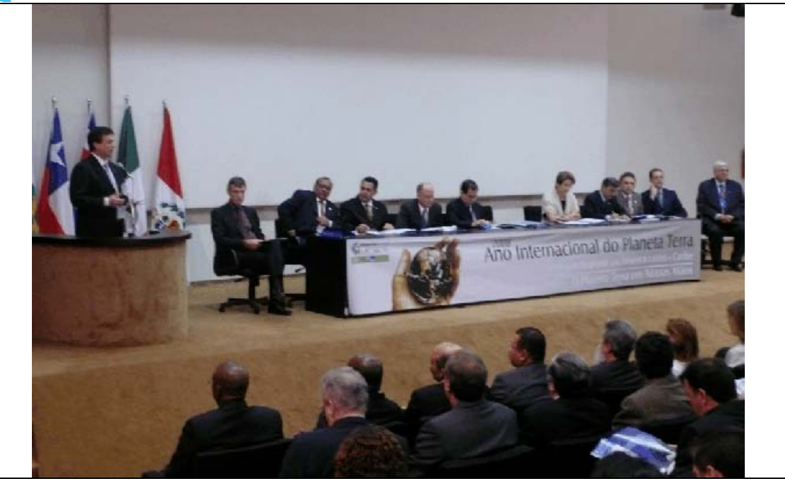
Opening Ceremony with Minister of Science and Technology and other authorities