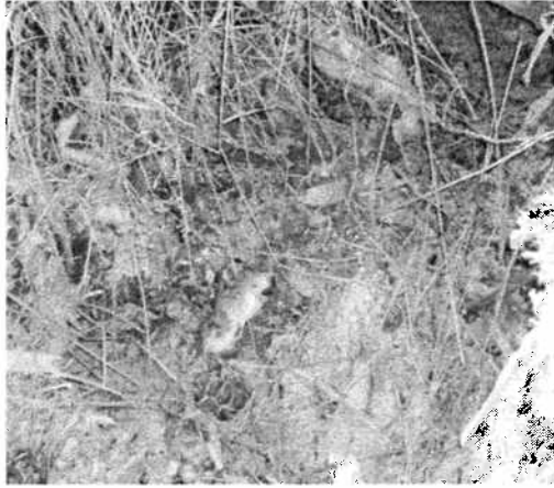
Fig.3 Photograph of a rat, which died after inhaling a harmful gas~(carbondioxide) at Shuwaga gas stream, Rungwe volcanic Province.

Despite of the risks associated with Volcanic Hazards, the richness of the Land attracts people. Fertile soil rich in iron and other nutrients needed by plants are attracting millions of people in rice growing areas in Rungwe district. The fertility of the soil also support growing maize, beans, potatoes and tea plantations making Rungwe one of the best supplier of food in Tanzania.