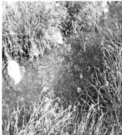
Fig 2: Photography showing gas (Carbondioxide) bubbles emanating from the base of a stream at Shuwaga area.

caused deaths of natives as well as animals who passes nearby especially during the night and morning since the rate of photosynthesis, is low (Figure3). Numerous amount of Fluorine is also emitted into the water sources and its effects have been visible to the villagers living around Ngozi and Masoko Crater Lakes in the RVP where the colour of teeth changes to brown. There is also a possibility of bone weakening and fluorosis diseases due to high concentration of fluoride in both surface and groundwater resources. There is elevated concentration of trace elements in the hot and cold springs around the RVP that can pose serious health risk to the population residing in the area. For example, the concentration of arsenic, which is a highly toxic metal, varies between 98 and 168 ppb, which is 10-17 times more than the WHO recommended guideline for the portable water.